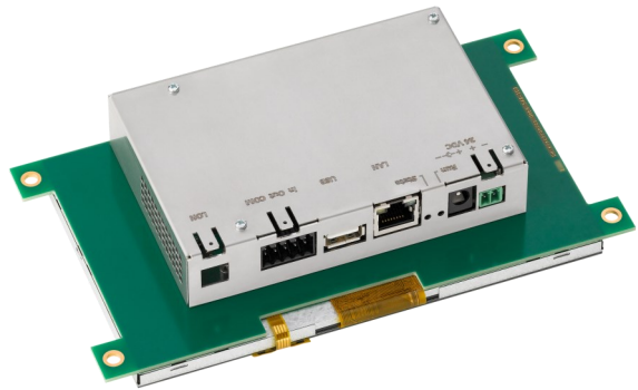
Optional with Front Frame